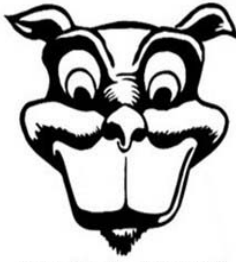
Origin - "Back to Bunyip 1959"